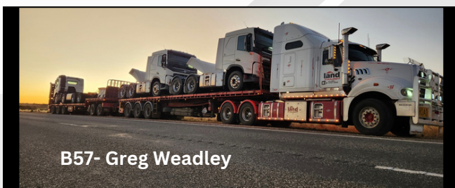
B57- Greg Weadley