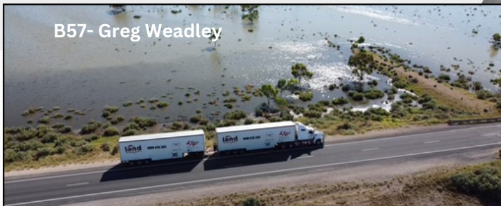
B57- Greg Weadley